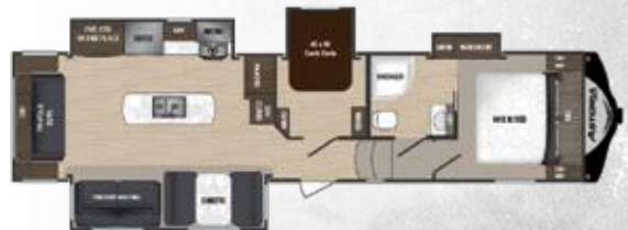
ASTORIA | 3273MBF Ext. Length: 36' 6" Ext. Height: 12' 10" Average Shipping Weight: 9,934 Sleeps: 10