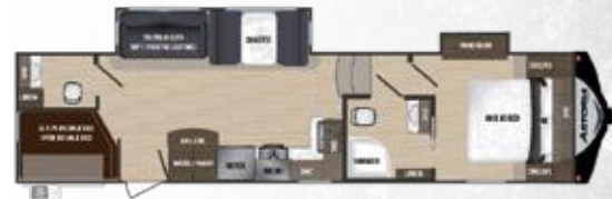
ASTORIA | 3123BHF Ext. Length: 35' 8" Ext. Height: 12' 9" Average Shipping Weight: 9,052 Sleeps: 10