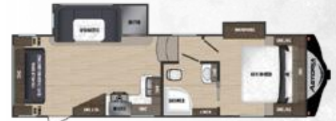
ASTORIA | 2513RLF Ext. Length: 30' Ext. Height: 12' 9" Average Shipping Weight: 7,652 Sleeps: 4