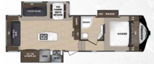
ASTORIA | 2953RLF Ext. Length: 33' 8" Ext. Height: 12' 8" Average Shipping Weight: 8,954 Sleeps: 6