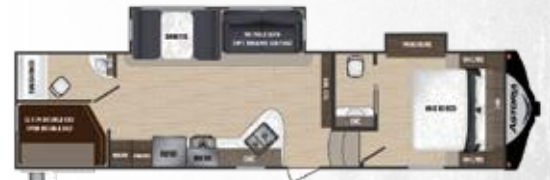
ASTORIA | 3013BHF Ext. Length: 35' Ext. Height: 12' 9" Average Shipping Weight: 8,706 Sleeps: 10